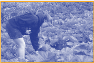
Youth Homes teen works at the River Road Community Garden