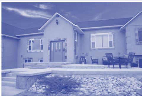
The new Bitterroot Youth Home

The BYH board and staff first looked at the house two years ago when it came onto the market. However, the $400,000 asking price was not feasible, so they kept looking into other options. With the downturn in the economy, the home went into foreclosure and the Youth Homes board approved buying it and renovating it to meet